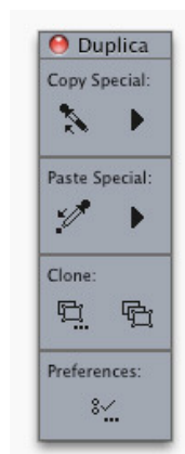
Duplica Palette (Window Menu→Show/Hide Badia Duplica Palette)

You can access the Duplica features by using its palette ( Window menu → Show/Hide Badia Duplica Palette ), the Edit menu, the contextual menus, or the keyboard equivalents :